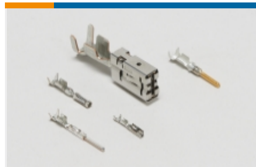
Automotive Terminals (125)