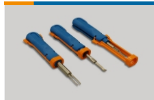
Insertion &amp; Extraction Tools (13)